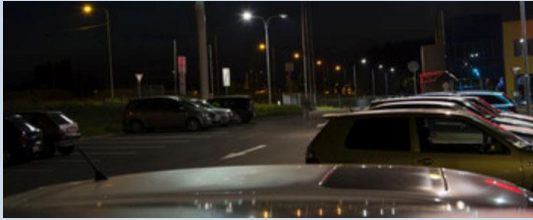
Secure nightly parking